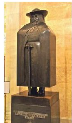
Statue of Father Damien in the US Capitol

"What if Father Damien were, by all accounts, unkempt, stubborn, pig-headed and the very idea of him rubbed you the wrong way? And if this same person laid down his own life, nay, not for his friends, but for suffering strangers simply because he saw Christ in them, would you cast your human pettiness aside? Could you recognize that there was a saint in your midst?"